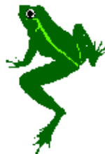
16 – Frog