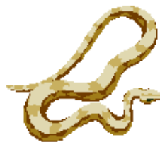
20 – Snake