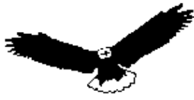
10 – Eagle