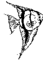
15 Small Fish