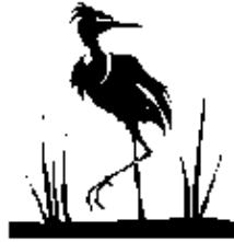
11 – Heron