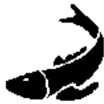
13 – Large Fish