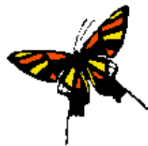
17 – Butterfly